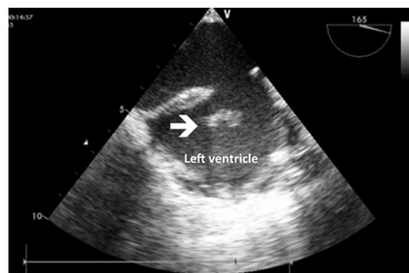
Figure 2. Echogenic thrombus formation in the left ventricle