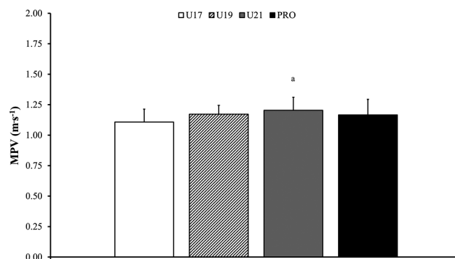
FIG 2. Comparison of mean propulsive velocity (MPV) in the jump squat exercise using 40% of the athlete's body mass among under-17 (U17), under-19 (U19), under-21 (U21) and professional (PRO) age categories. a significantly different from U17 ( p < 0.05 ).